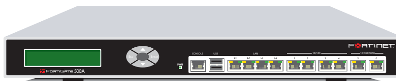
Figure 1: FortiGate-500A

The FortiGate-500A is ideally suited for enterprise networks, the FortiGate-500A is unmatched in capabilities, speed, and price/performance.