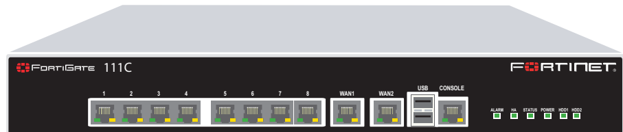
Figure 1: FortiGate-111C

Internal hard drives provide additional functionality for logging and content archiving.