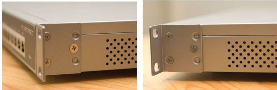
Figure 2: Installed mounting brackets

The following photos illustrate how the brackets should be mounted. Note that the screw configuration may vary depending on your FortiGate unit.