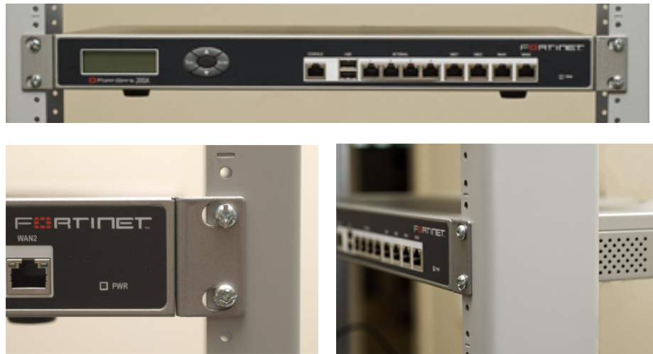
Figure 3: Mounting in a rack